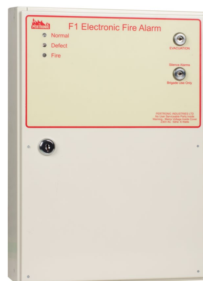
The Pertronic F1-3