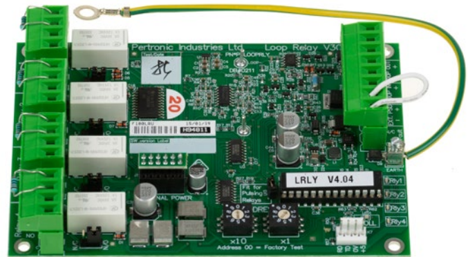
Pertronic Analogue Addressable Loop Relay

The loop relay has two configurable output settings. When configured for “steady-only” operation, each active output stays on until de-activated by the fire panel. With pulsing enabled, the fire panel can activate each individual output