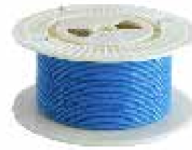
Pertronic-Anbesec Linear Heat Detection Cable on 200 Metre Drum

LHD cable sensitivity is not affected by installation temperature or the length of cable heated by a fire.