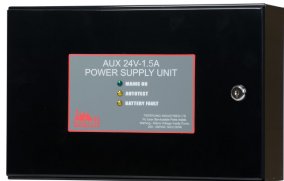
Pertronic 24 Volt 1.5 Amp Auxiliary Power Supply in Lockable Battery Cabinet (AUX24V-1.5PSU-BLK)