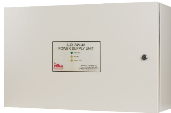
Pertronic Auxiliary 24V, 4A Power Supply (AUX24/4PSU)