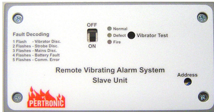
Figure 1: Top Cover