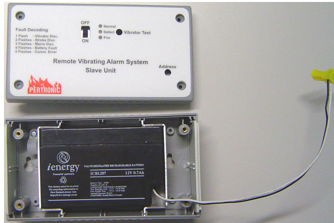
Figure 3: Battery Ready for Connecting